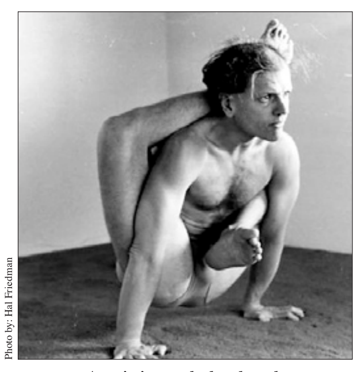
A variation on the handstand.

n addition to breath and playing your edges, there is a third dimension to physical yoga. This dimension involves channeling energy to different parts of the body by creating what I call "lines of energy." These lines of energy are vibratory currents that move in different directions within each posture. Descriptions of internal states are approximations at best. Even the word "energy," when it is used to signify an inward level of activation, may seem vague. Yet we are aware of having more or less energy. If you pay attention, you may notice that some parts of the body seem alive and vital, while others feel dead